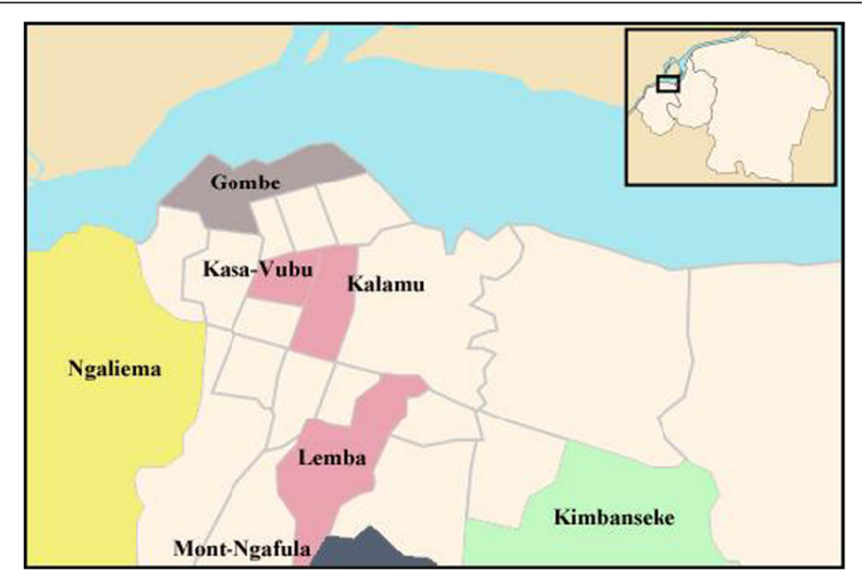
Figure 1 Map of the city and the province of Kinshasa. The figure illustrates the seven municipalities that were selected for the study. In the centre: Kalamu, Kasa-Vubu, and Lemba; in the east: Kimbanseke; in the west: Ngaliema; in the south: Mont-Ngafula; and in the north: Gombe.

variables were: age, place of residence, marital status, education level, occupation, religion, and parity. KAP was assessed through a series of questions (Tables 1, 2, 3 and Additional files 1 and 2).